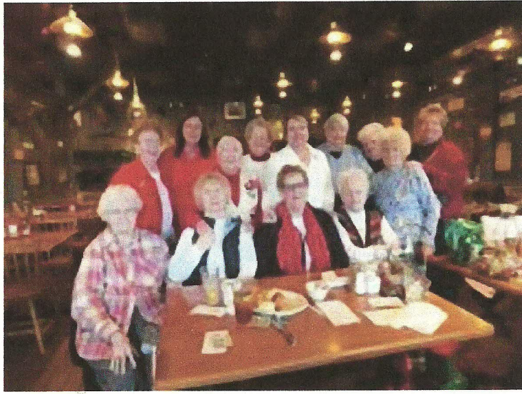
Women's Auxiliary Christmas Dinner 2012